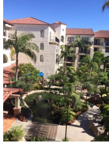
Huntington Beach, 2017 AGM