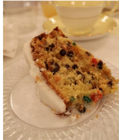
2017 Twelfth Cake

Attire: Elegant; Regency attire optional