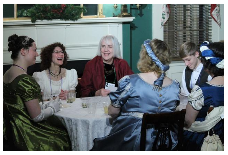
The Card Room